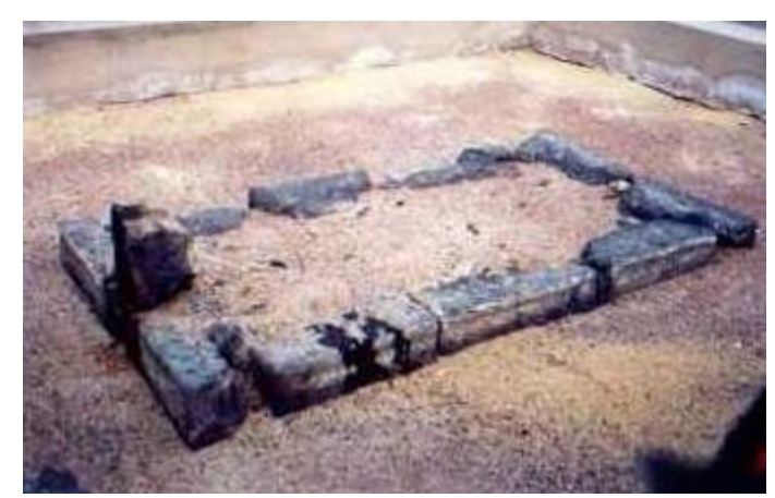
Tomb of Uthman in Baqi cemetery, Madinah

differences in pronunciation of some words in the Qur'an. Uthman (ra) called for all the available scripts in various forms, appointed a committee consisting of those who wrote down during a revelation and standardized the Qur'an.